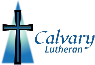
Calvary Lutheran Church Park Rapids Northwestern Minnesota Synod

The work of LSS is a mosaic of amazing acts of caring and courage in communities everywhere. The Servant of Christ Award is one of the ways that LSS honors those amazing acts. Annually, LSS recognizes one or more congregations in each of Minnesota's six ELCA synods that are leaders in social ministry. LSS was pleased to recognize the following congregations with the 2024 Servant of Christ Award: