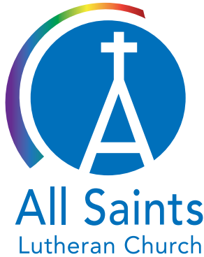
All Saints Lutheran Church Eagan Saint Paul Area Synod