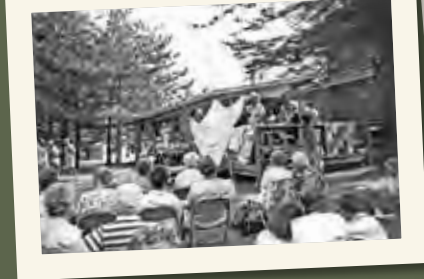
Above: Camp Knutson through the years. Below: Camp K Staff Alumni and their families gathered over Labor Day weekend.