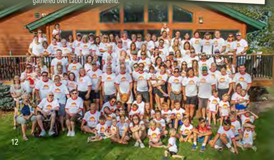
Below: Camp K Staff Alumni and their families gathered over Labor Day weekend.